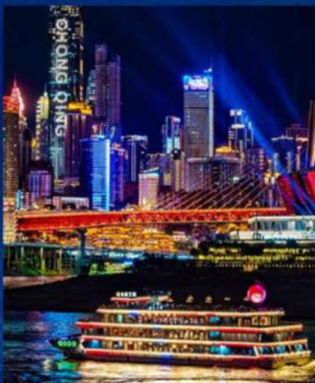
绝美夜景-夜游朝天门码头