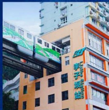
魔幻8D山城-李子坝轻轨穿楼