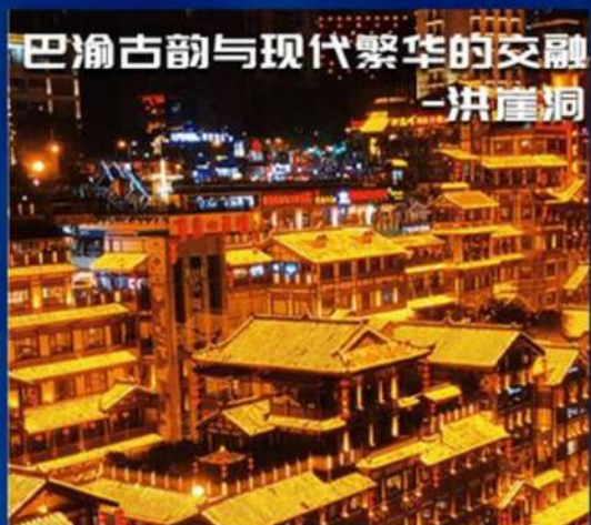
巴渝古韵与现代繁华的交融 - 洪崖洞