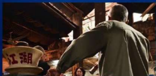
老重庆的烟火气-交通茶馆